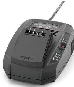
HUSQVARNA ASPIRE™ 18V C70 2.5AH BATTERY CHARGER 970 60 10-03