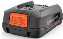
HUSQVARNA ASPIRE™ 18V B45 2.5AH BATTERY 970 60 08-01