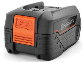
HUSQVARNA ASPIRE™ 18V B72 4.0AH BATTERY 970 60 09-01